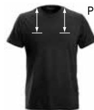
Placements 1 and 3